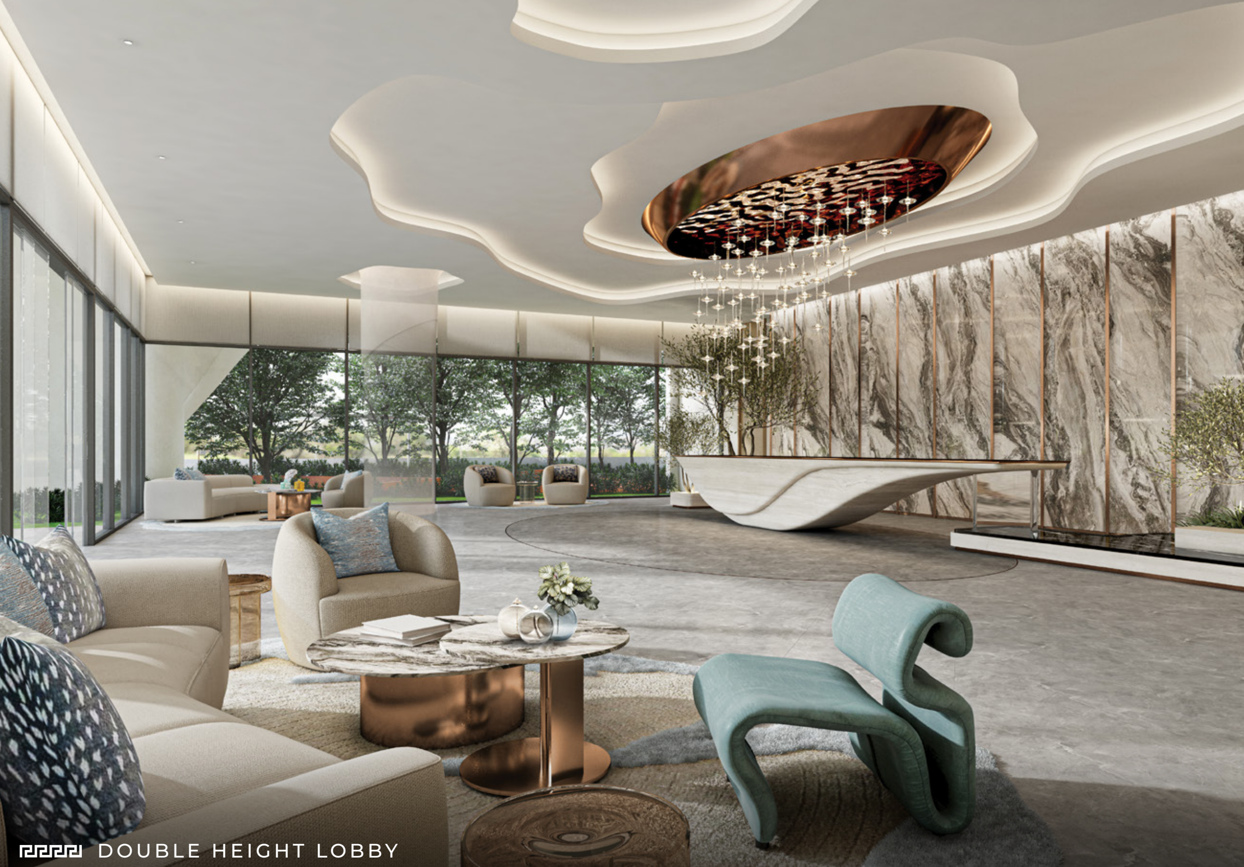
DOUBLE HEIGHT LOBBY