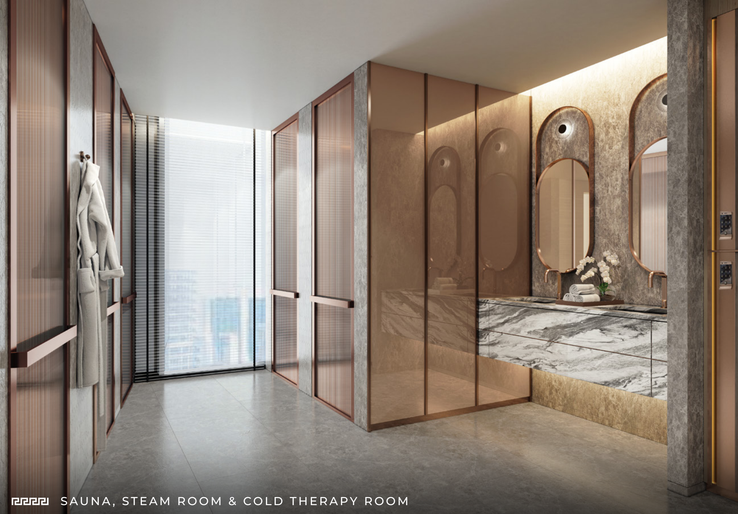
SAUNA, STEAM ROOM & COLD THERAPY ROOM