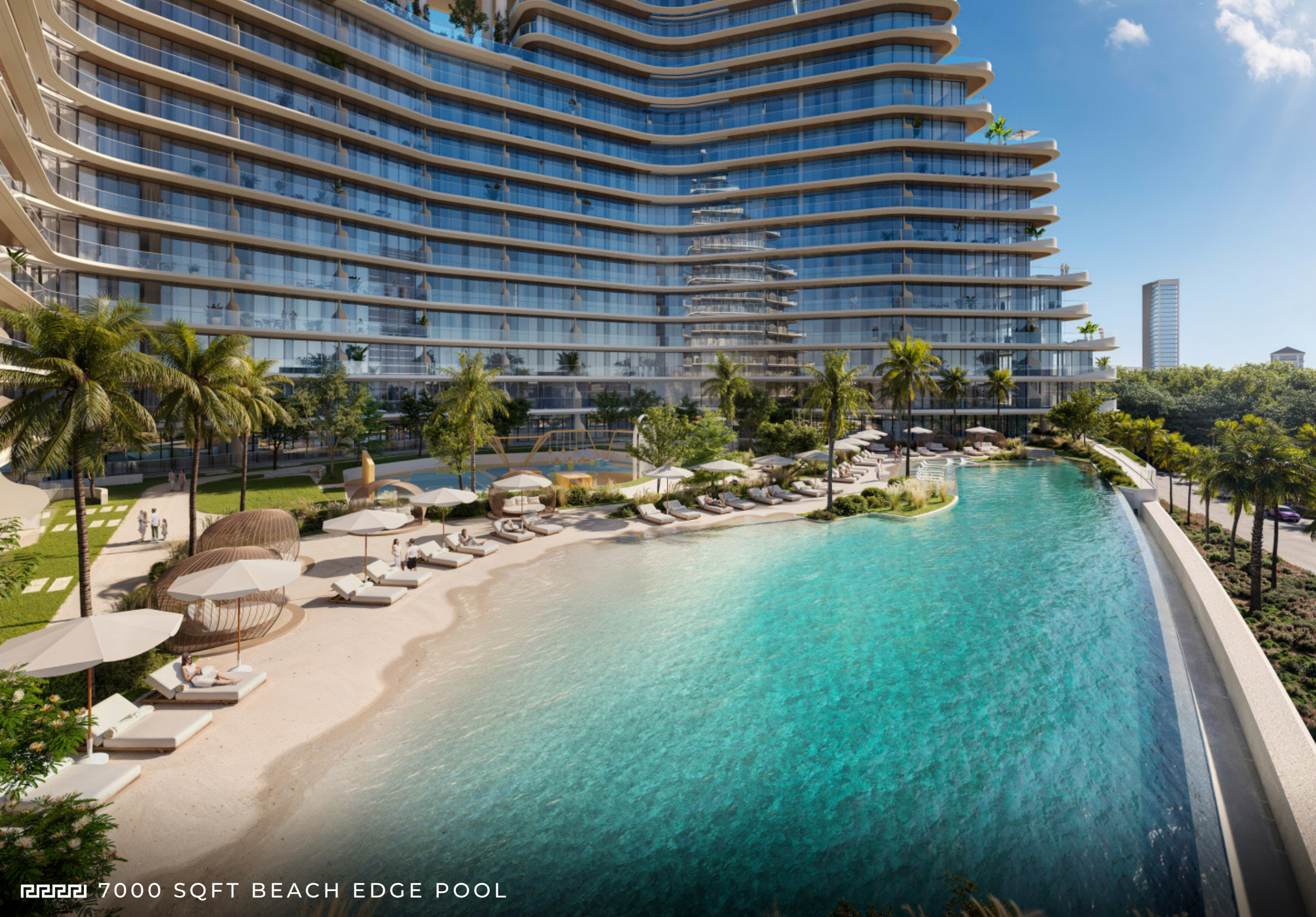
7000 SQFT BEACH EDGE POOL