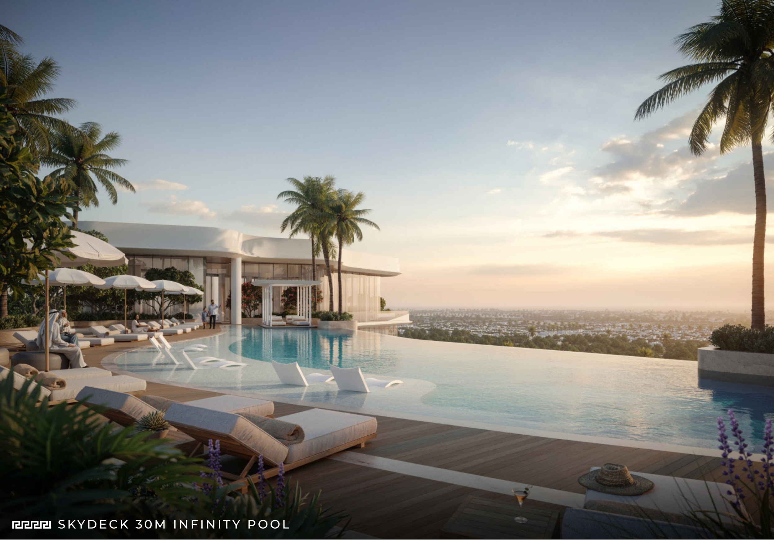
SKYDECK 30M INFINITY POOL